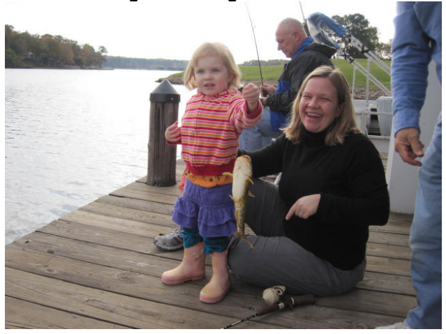
Official 2012 TUFF Derby Scoreboard:

of Hidden Lake reeled in a one pound catfish during the October KCC Fish for Fun at the Country Club Marina dock, while also displaying some great fishing fashion sense!